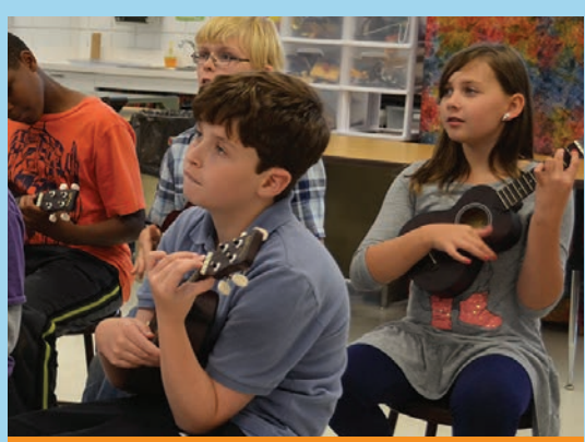
Our Specialists' Room – the home for Art, Spanish, and Music – now houses enough ukuleles so that every student can play.