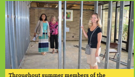
Throughout summer members of the administrative team checked in on the building.