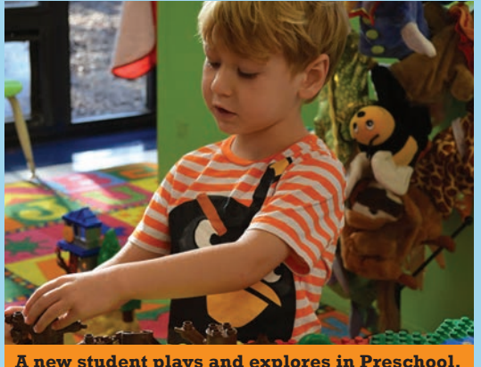
A new student plays and explores in Preschool, where creativity is encouraged and celebrated.