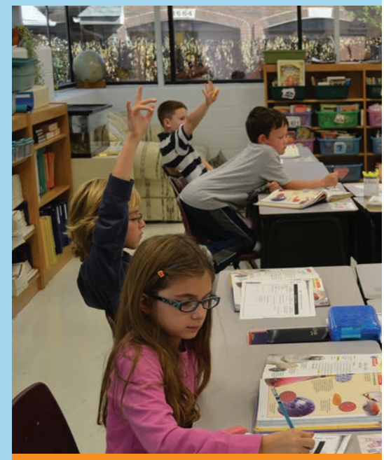
Middle Class, situated in a corner, has two walls of windows. Here, students participate in Science class.

The best way to see our new school But in case you can only visit in pic at what you would see every day ... learning. They quickly embraced th