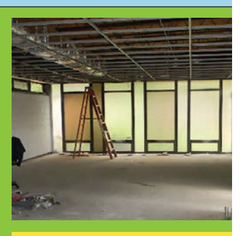
The Preschool room had promise the renovation phase ... we knew bathed in light.