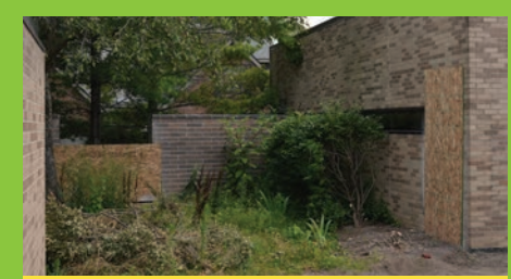
We love our new courtyard, but it didn't start out looking great. Now it's a wonderful space for group activities and play.