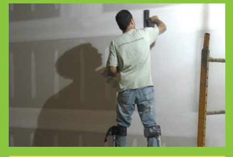
Most areas received new walls. Here a drywaller works in what would become Primary Class, a bright new space.