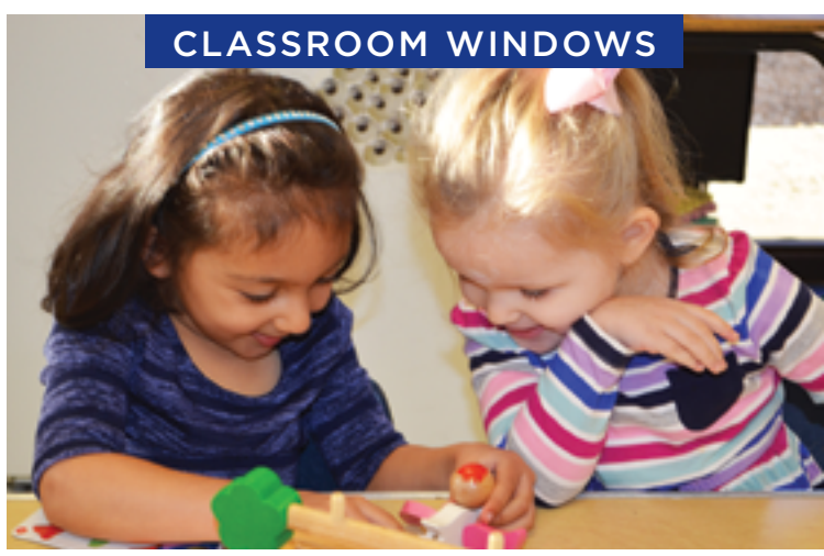
"Take a walk with me into our classrooms. These engaged students and those of the past, and those of the future — will continue to be the heart of Japhet School. Always."