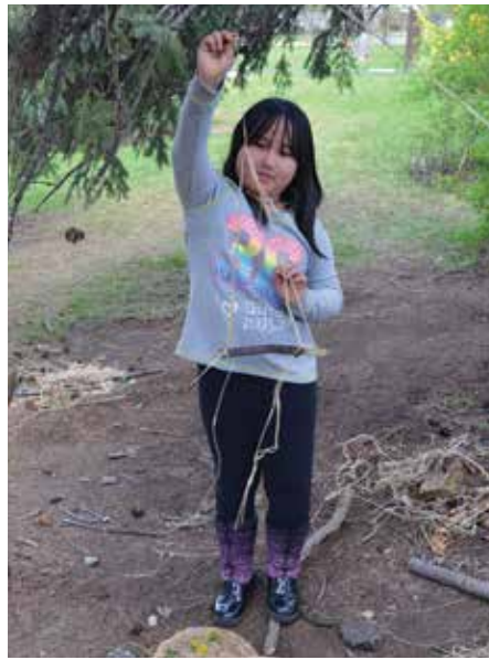
A Primary Class student plays with raffia to create an element for her "homestead" in the Pioneer Village.

Even after 25 years of working with children, I am still inspired by students' ingenuity and creativity. Japhet has a lovely grassy play area with sun and shade, and the path to it features a number of large pines. Students have created a most amazing play space among the pines that they call Pioneer Village. This child-driven idea