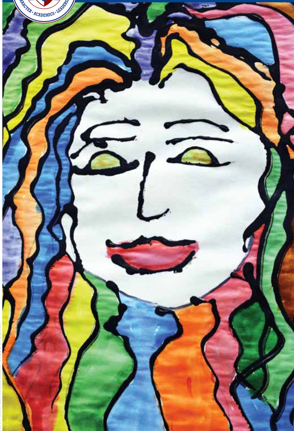
Artwork: Intermediate Class student