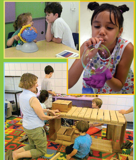
Peace Campers play cooperatively!

Peace Camp is in harmony with Japhet’s mission – to nurture and prepare each child for life by integrating character education with a strong academic program – by giving students practical solutions for peacemaking and introducing them to new ideas about the social and natural world around them.