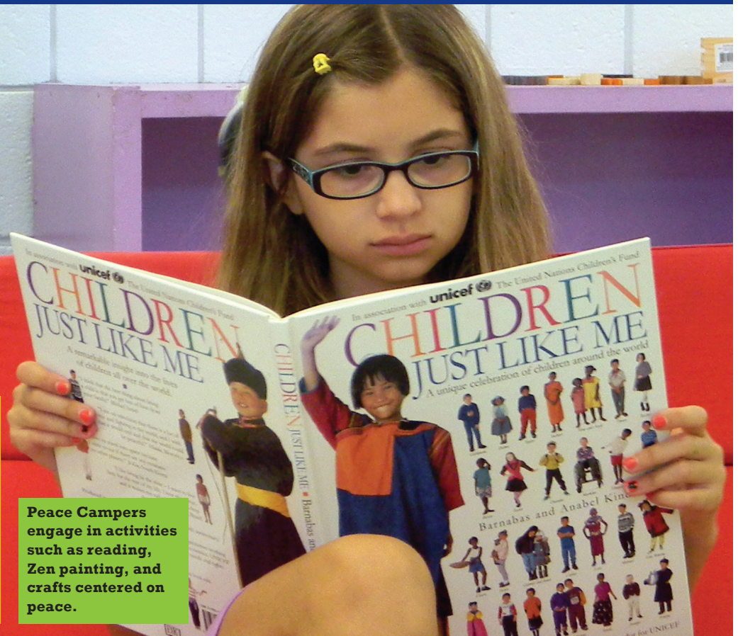
Peace Campers engage in activities such as reading, Zen painting, and crafts centered on peace.