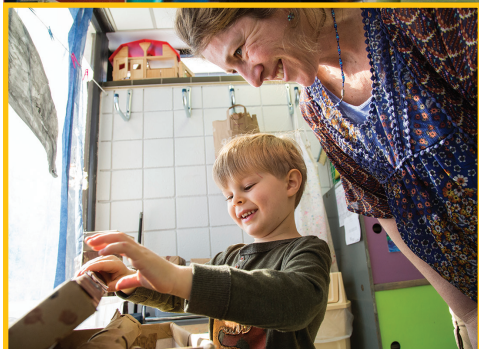
A student delights in the finds of a “treasure chest” with shells to count and a map.