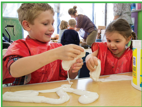
Two students play with “whale blubber” — a semifluid, tactile substance.