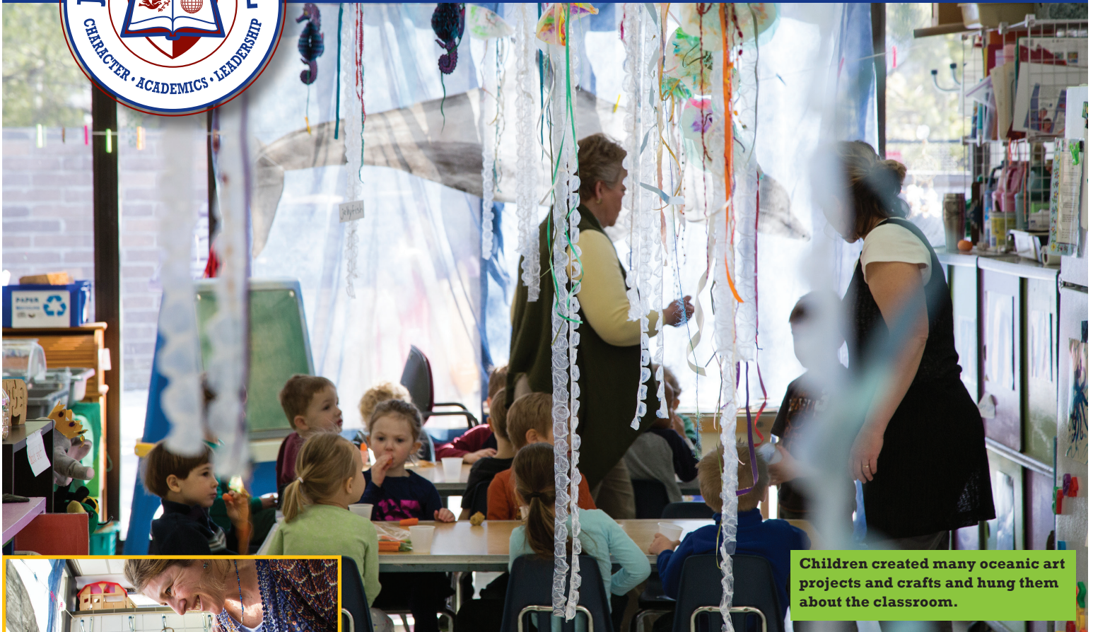
Children created many oceanic art projects and crafts and hung them about the classroom.

AWARD-WINNING NATIONAL SCHOOL OF CHARACTER