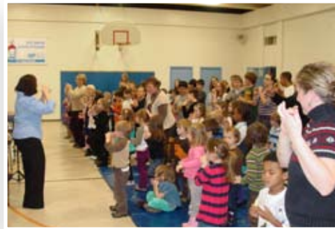
Percussionist duo Musica Batteria taught students that they all have their own “built in” percussion instrument during an all-school music assembly.