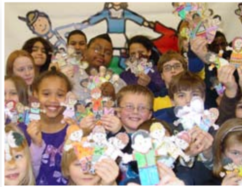
We recently sent more than 200 paper dolls to impoverished children in India. Sponsored by Rotary International, this service project enabled our students to help color, cut, and assemble the dolls.