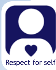
Respect for self