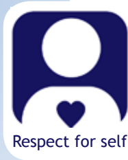
Respect for self