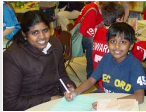
Family Math Night invited parents and their children to test their math skills together with activities such as Recipe Math, Time Jeopardy, an Estimation Station, and much more.