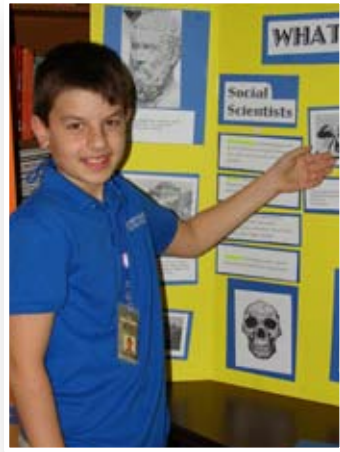
During Social Studies Fair, Intermediate Class students (left) were tour guides through a prehistoric hands-on museum, and Middle Class students (right) prepared reports and skits about Michigan and its history.