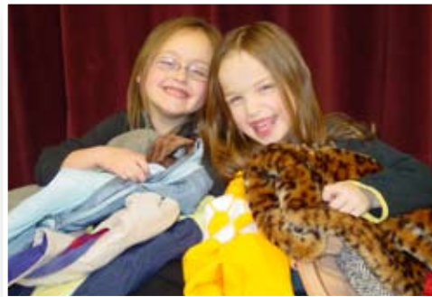
Japhet’s Recycling Committee sponsored a coat drive for the South Oakland Shelter. Here, two Kindergarten students pile up with some of the donations.