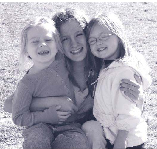
This Upper Class girl had two Preschool buddies to play with on our annual Pumpkin Patch field trip. "Buddy" activities take place all year long.