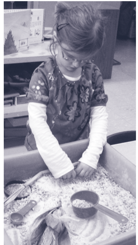
Preschoolers enjoyed playing with the texture of loose, dried corn during their study of harvest in the fall.