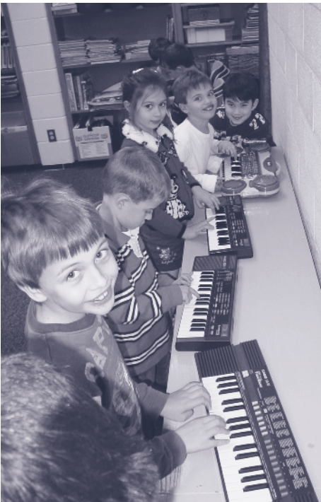
All Japhet students, like these Primary Class keyboardists, have music class each week.