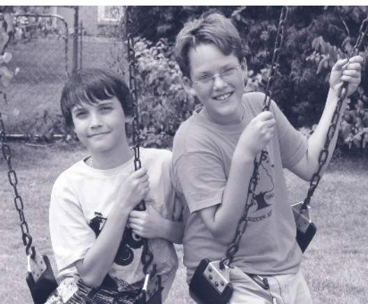
Daily recess and exercise is an important part of each student's day, including that of these seventh-grade boys.