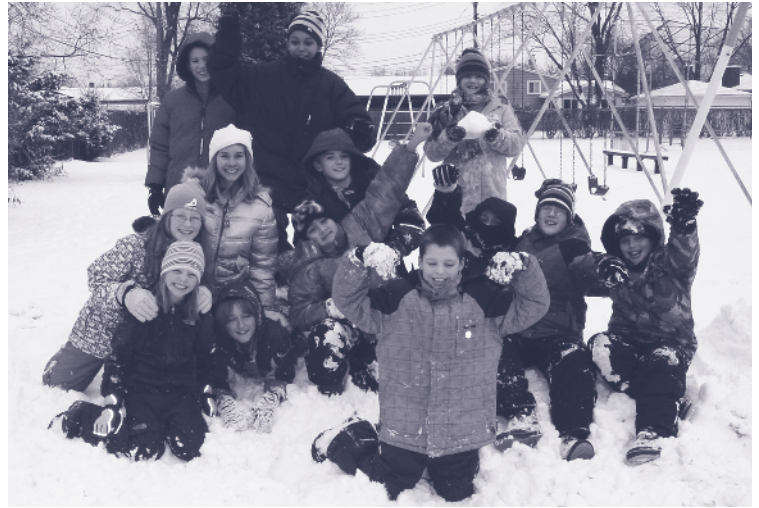
These Intermediate Class students enjoy snow play during a wintery recess!