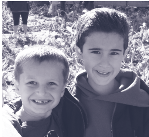
This pair of pals enjoyed a beautiful fall day at the Pumpkin Patch.