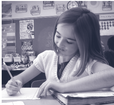
This Middle Class student sets a fine example of industry.