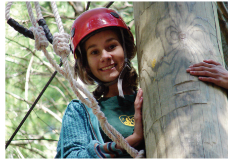
This Upper Class student joyfully and courageously tackled a treetop ropes course at LOC.

The Lesson of the False Summit – often we think we have reached the top, completed our task, or achieved our goal only to learn that there is still more to do if we want to do our best. You have to reach deep inside and find the courage and determination to get to that final summit and truly reach your goal.